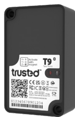
Bluetooth® Edition T9.410

It includes a built-in radio beacon for close-range location recovery when activated.