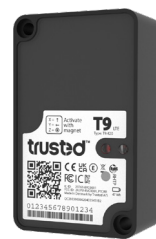
RHTP Edition T9.420

This enables tracking even when regular network coverage is unavailable.