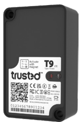
Standard Edition T9.400