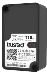
Standard Edition T10.400