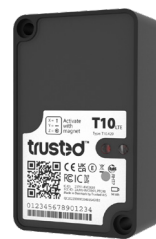
RHTP Edition T10.420

This enables tracking even when regular network coverage is unavailable.