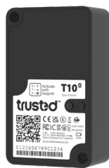
Bluetooth® Edition T10.410

It includes a built-in radio beacon for close-range location recovery when activated.