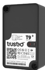
Bluetooth® Edition T9.410

It includes a built-in radio beacon for close-range location recovery when activated.