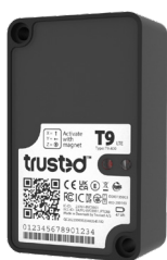
Standard Edition T9.400