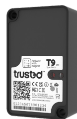
RHTP Edition T9.420

This enables tracking even when regular network coverage is unavailable.